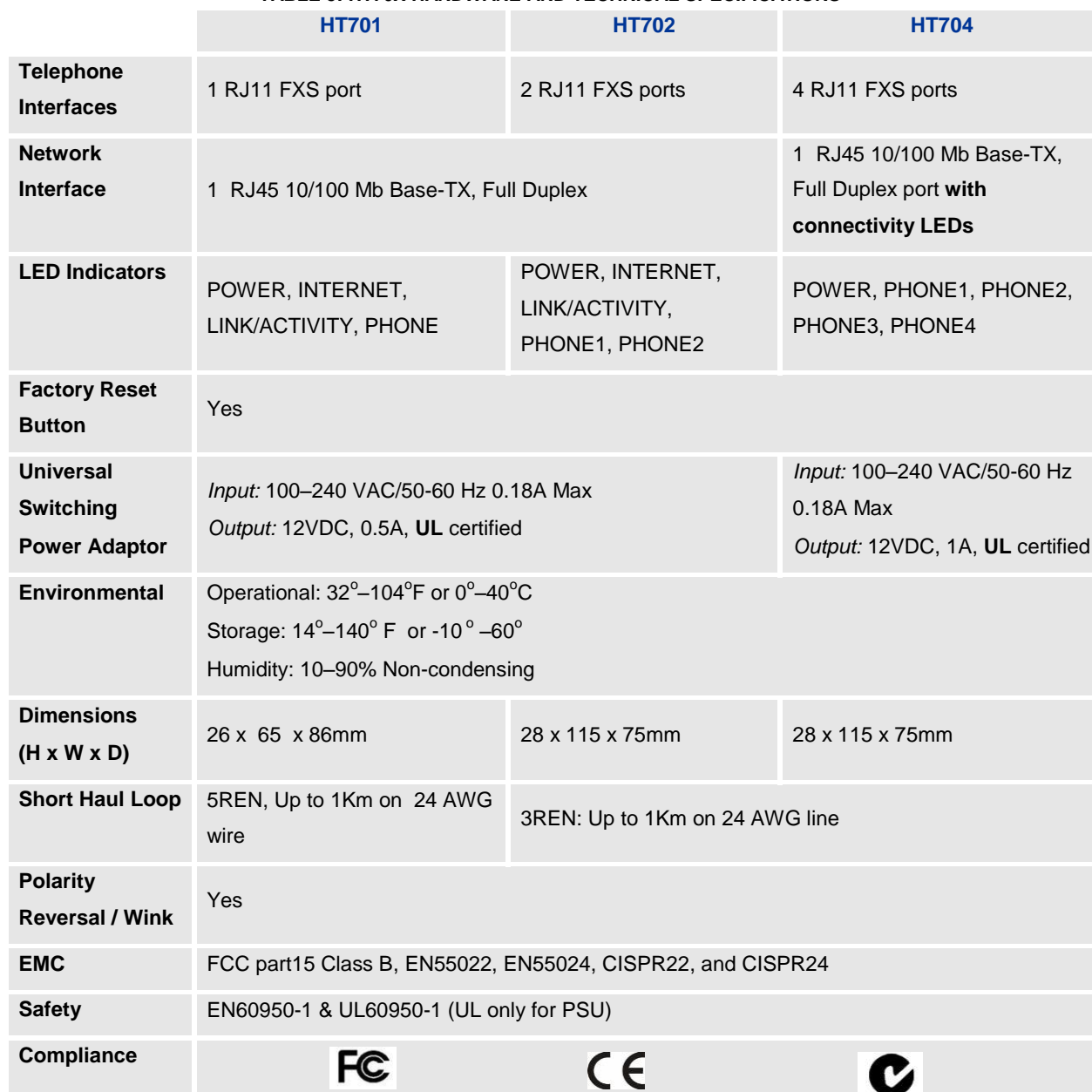
TABLE 5: HT70X HARDWARE AND TECHNICAL SPECIFICATIONS

The table below lists the Hardware and Technical specification of HT70X.